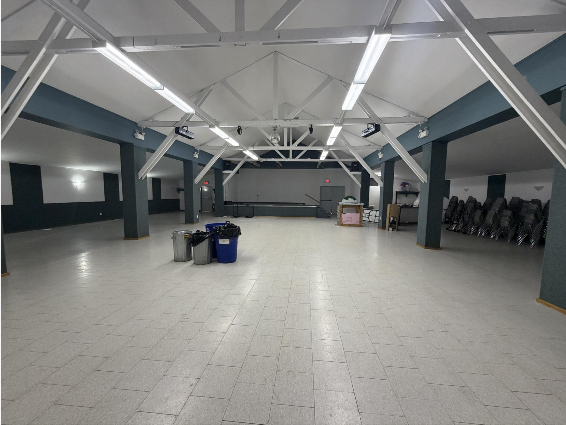
Interior Building Photos – 10310 Kylo Street