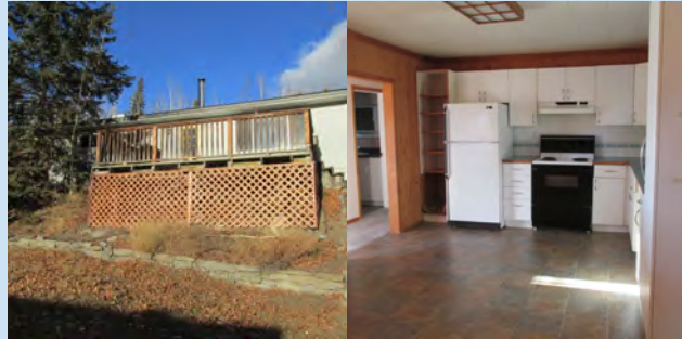
10714 Learmonth Street $175,000

This 940 square foot home is a great rental/investment property or starter home. It has new flooring throughout, a wood stove, large kitchen and eating area. And the best part is the green space surrounding the house and the great view of the valley and town site.