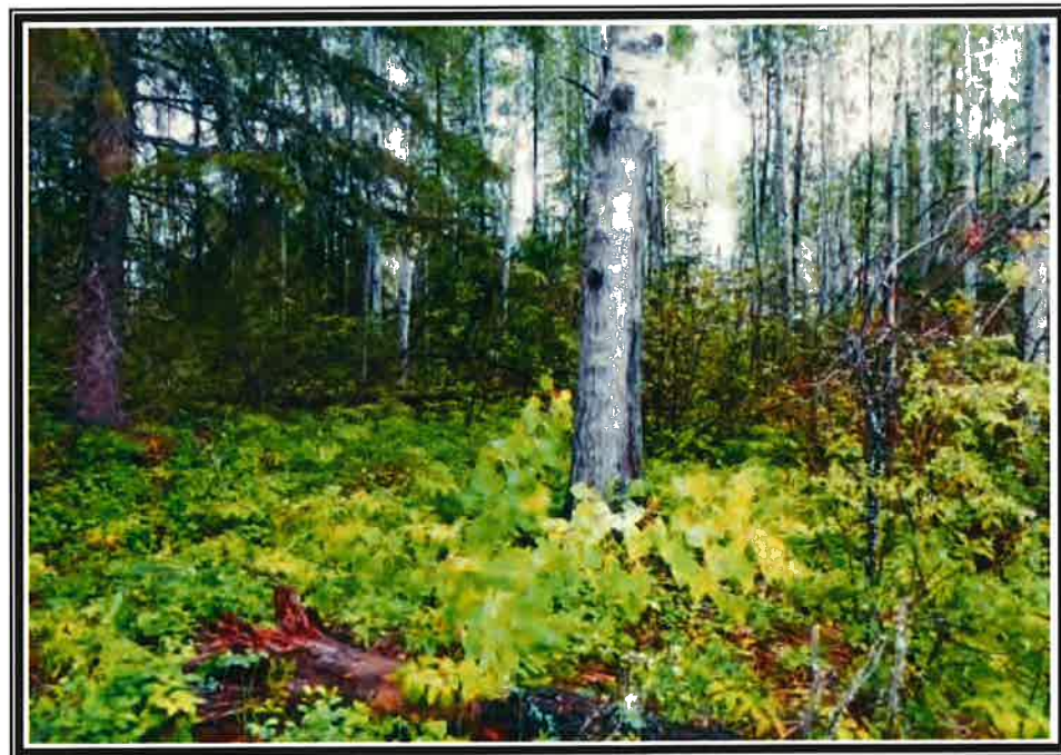
Plate 2 View northwest of proposed Lots 1 and 2 from southeast corner showing typical forest cover