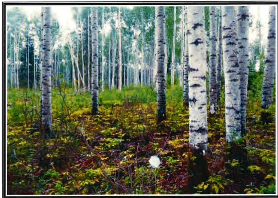
Plate 4 View southeast of proposed Lot 3 from northwest corner showing moderately well drained terrain and no ground visibility owing to vegetation cover