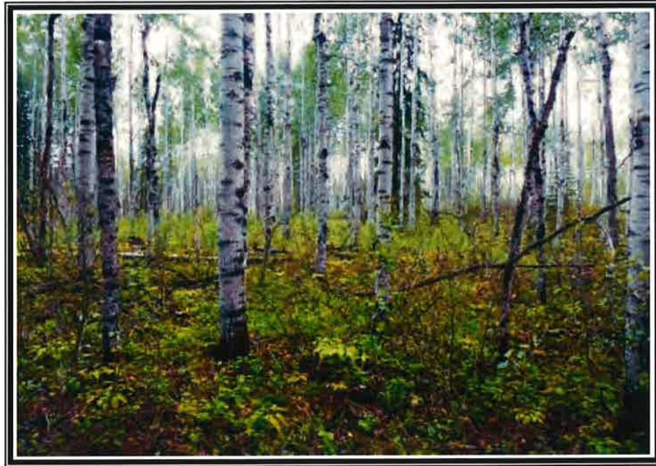
Plate 3 View southwest of proposed Lot 3 from northeast corner showing featureless terrain