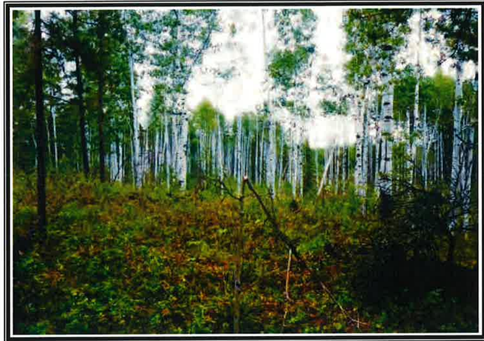
Plate 1 View northeast of proposed Light Industrial Subdivision Lots 1 & 2 from southwest corner showing gently undulating terrain