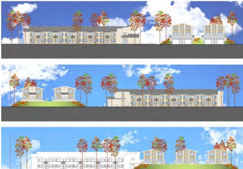
Left: An artist's rendering of the completed complex.

Housing provisions help to attract and retain the employees needed to sustain operations in the Hudson's Hope area.