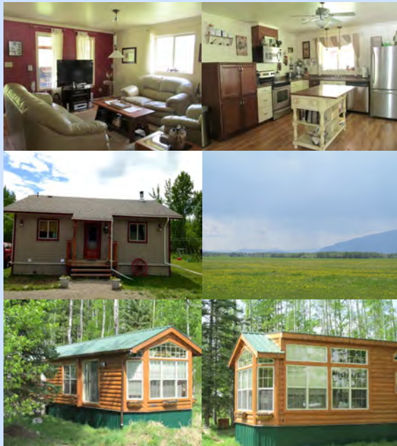
5004 BORING ROAD