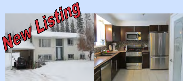
11519 FERGUSON STREET

¼ SECTION IN BERYL PRAIRIE, BUT TUCKED AWAY ON BORING ROAD AWAY FROM INDUSTRIAL TRAFFIC! THIS 2400 SQUARE FOOT HOUSE HAS A GREAT OPEN CONCEPT MAIN FLOOR, 4 BEDROOMS 1.5 BATHS, HAS HAD MANY IMPROVEMENTS AND RENOVATIONS DONE BY CURRENT OWNERS. 70 ACRES CLEARED FOR CULTIVATION THE REST IS READY FOR ADVENTURING, MEMORIES, AND ANIMALS! FULLY SERVICED GUEST HOUSE IS GREAT FOR VISTORS, RENTAL INCOME, OR TEENAGERS!! MUST SEE AND EXPERIENCE THE LIFESTYLE THIS PROPERTY OFFERS TO FULLY APPRECIATE IT.