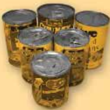
At least a three-day supply of non-perishable food. Manual can opener for cans