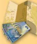
Local maps (identify a family meeting place) and some cash in small bills