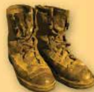
Seasonal clothing and footwear